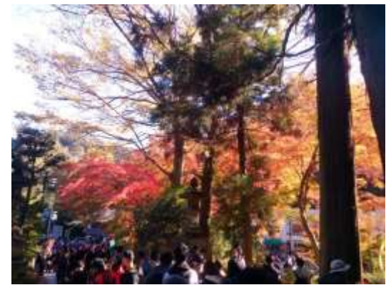
country due to weather conditions.